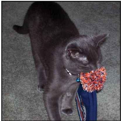
Frank at 5 months old, our first foster cat

I had grown up in a household full of animals but had never taken the plunge as an adult. I had been thinking about adopting a cat, but had been worried about making a long-term commitment. In January 2009 I discovered fostering and decided that it would give our family the best of both worlds. We could still have our freedom and enjoy the day-to-day living with a furry friend. I never imagined how wonderful and rewarding it would be becoming a foster home.